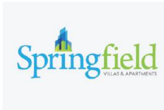
Spring Field Builders